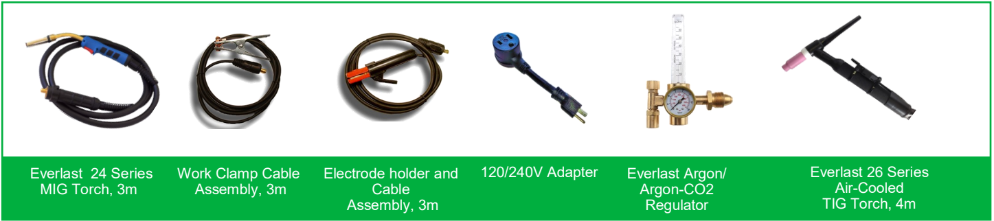
Everlast 24 Series MIG Torch, 3m Work Clamp Cable Assembly, 3m Electrode holder and Cable Assembly, 3m 120/240V Adapter Everlast Argon/Argon-CO2 Regulator Everlast 26 Series Air-Cooled TIG Torch, 4m

Actual appearance and quantity of accessories may vary.