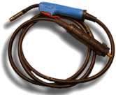
Everlast 15 Series MIG Torch, 3m