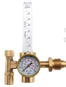
Everlast Argon/ Argon-CO2 Regulator

Actual appearance and quantity of accessories may vary.