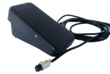
Everlast Foot Pedal