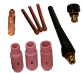
TIG Consumable Starter Kit

Actual appearance and quantity of accessories may vary.