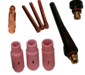
12.5 ft Everlast 9 and 20 Series TIG torch