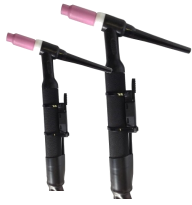
12.5 ft Everlast 9 and 20 Series TIG torch