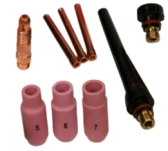
TIG Consumable Starter Kit

Actual appearance and quantity of accessories may vary.