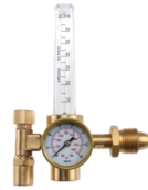
Everlast Argon/Argon/CO2 Regulator