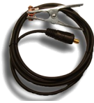
300 Amp Work Clamp Cable Assembly 10ft.