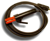
300 Amp Stick Electrode Holder 10ft.